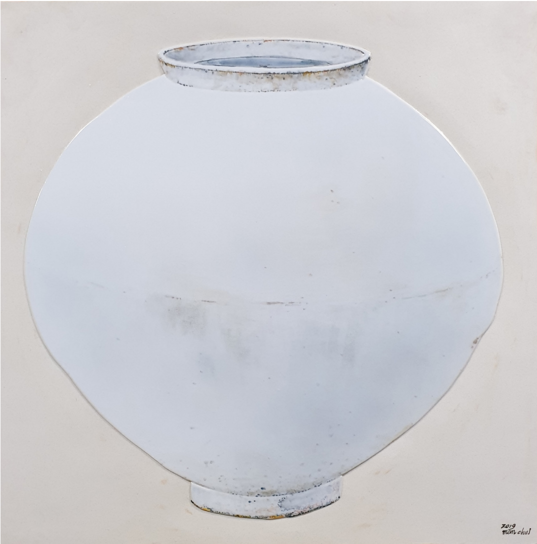
Rumination-Moon Jar, 57x57cm White Porcelain Plate, Lin Blend 1330 C, 2019