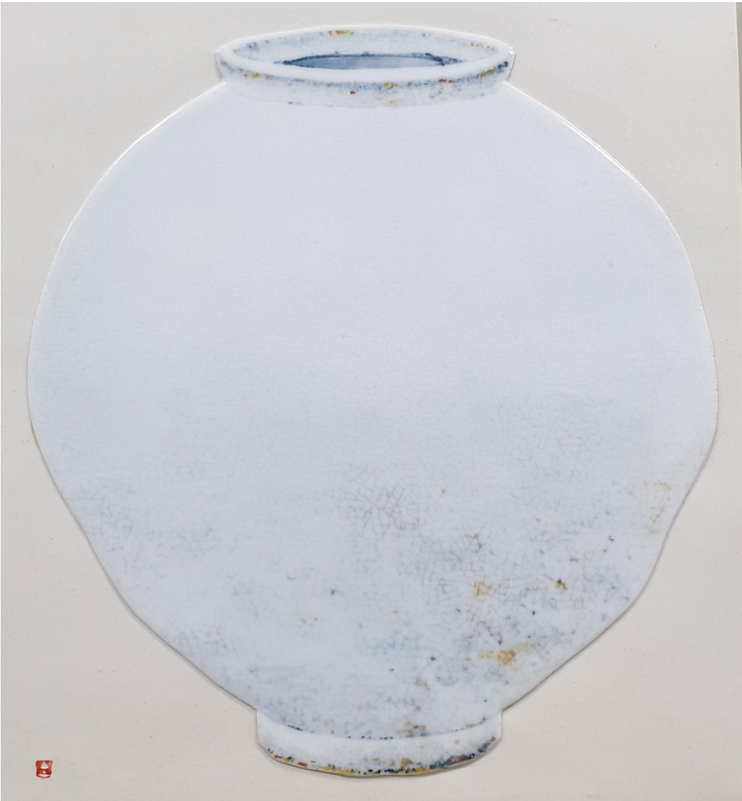
Rumination-Moon Jar, 57x57cm White Porcelain Plate, Lin Blend 1330 C, 2019