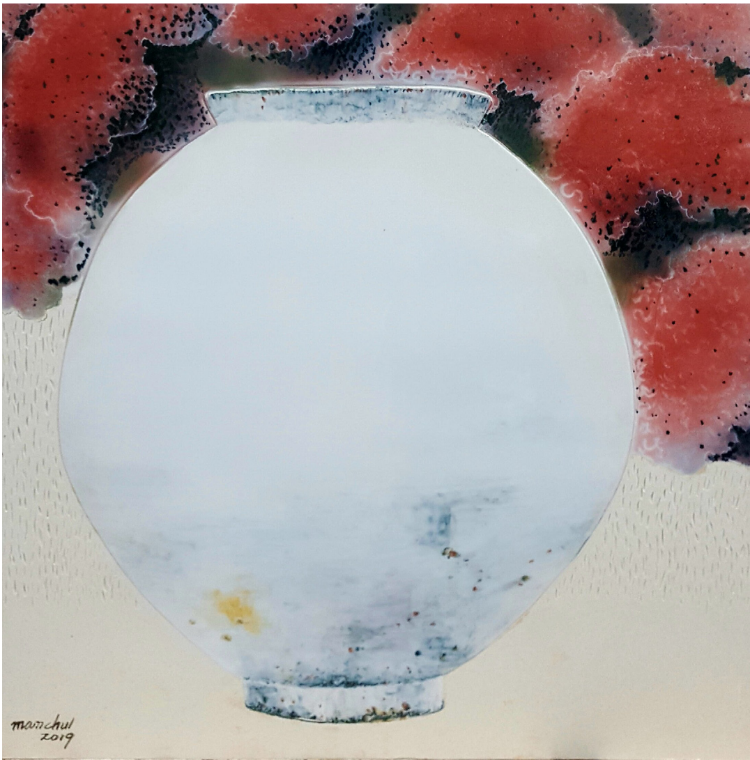
Rumination-Moon Jar, 57x57cm White Porcelain Plate, Lin Blend 1330 C, 2019