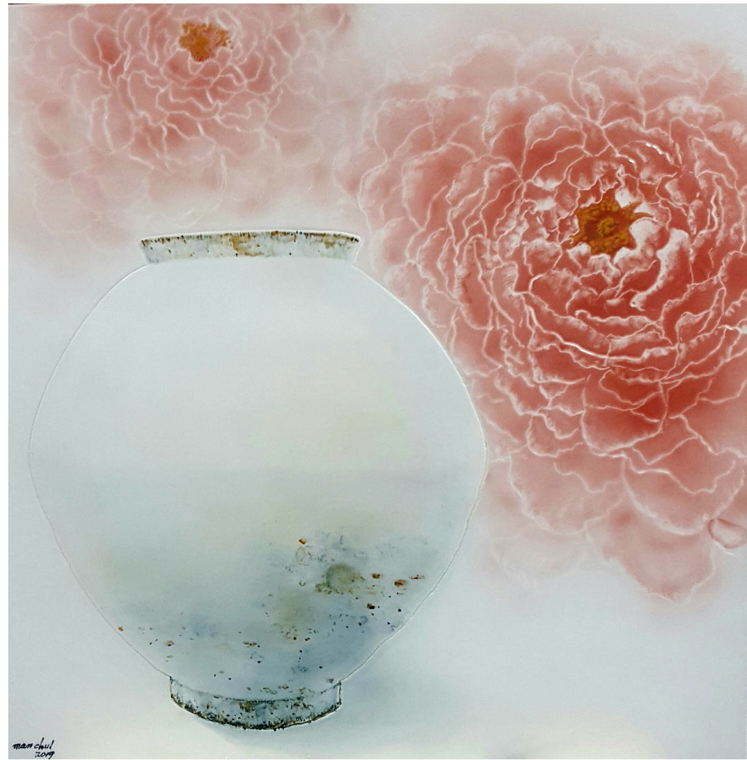
Rumination-Moon Jar, 81x81cm White Porcelain Plate, Lin Blend 1330 C, 2019