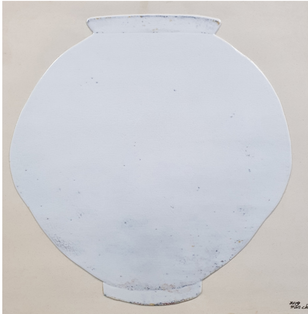
Rumination-Moon Jar, 57x57cm White Porcelain Plate, Lin Blend 1330 C, 2019