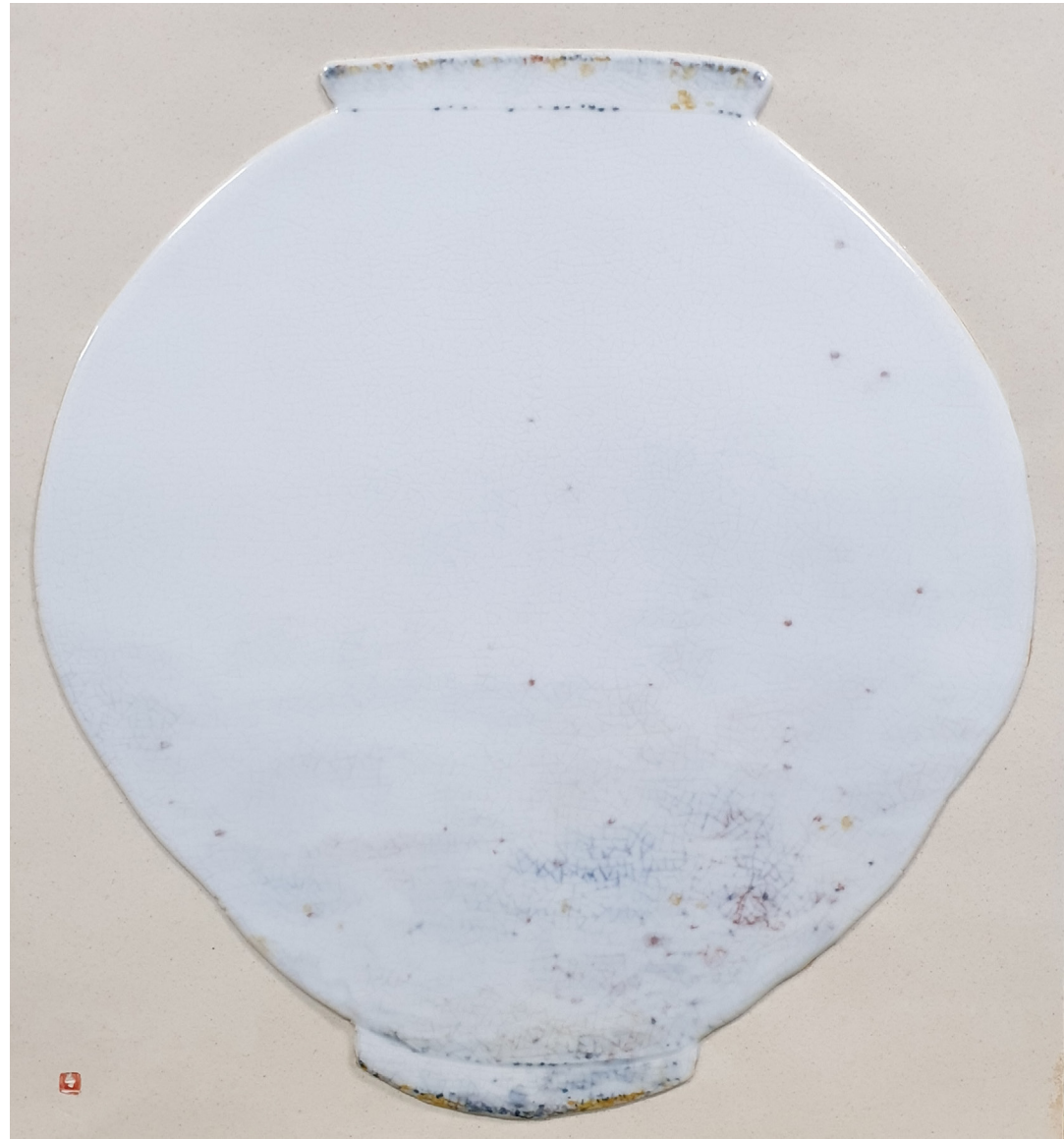
Rumination-Moon Jar, 57x57cm White Porcelain Plate, Lin Blend 1330 C, 2019