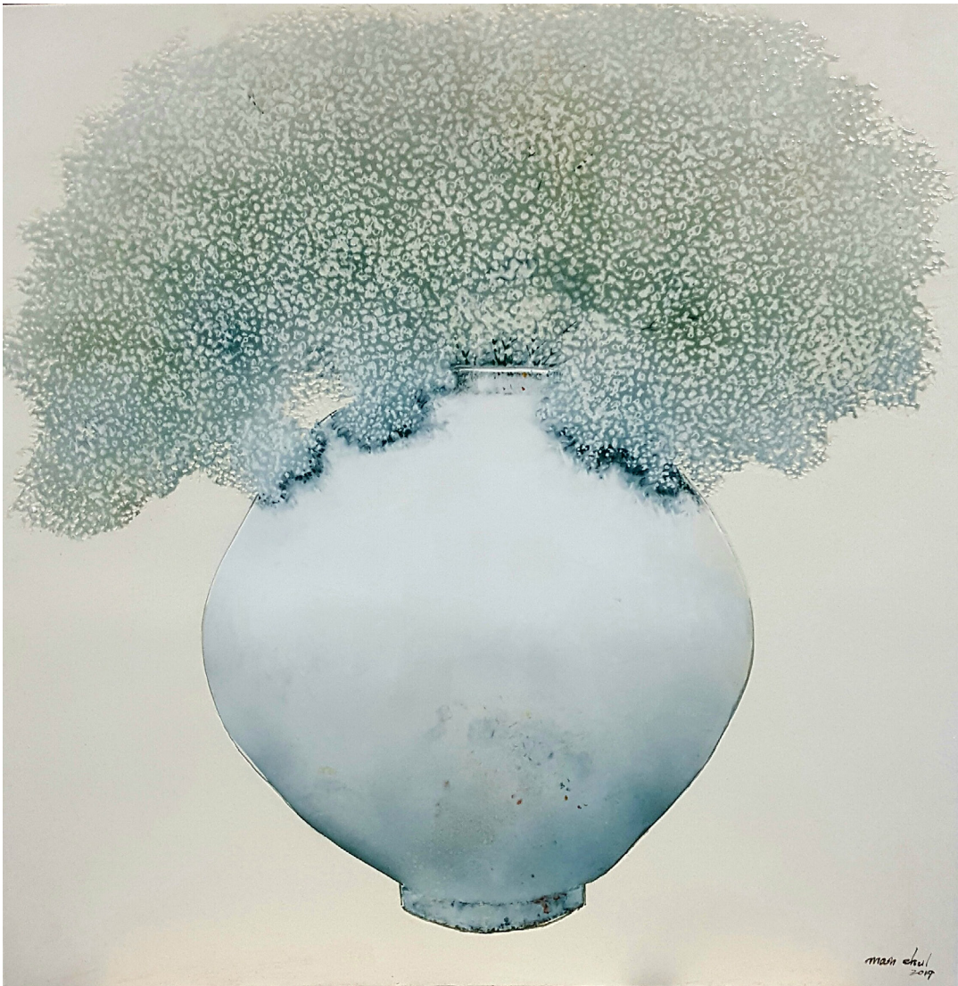
Rumination-Moon Jar, 81x81cm White Porcelain Plate, Lin Blend 1330 C, 2019