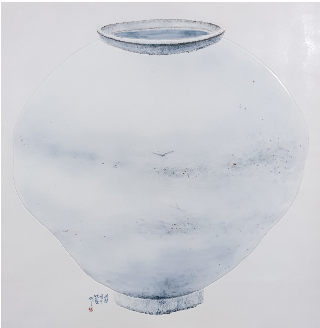
Rumination-Moon Jar, 81x81cm White Porcelain Plate, Lin Blend 1330 C, 2019