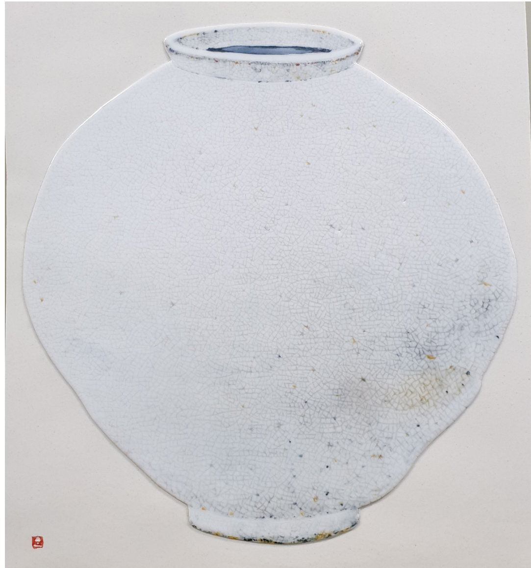
Rumination-Moon Jar, 57x57cm White Porcelain Plate, Lin Blend 1330 C, 2019