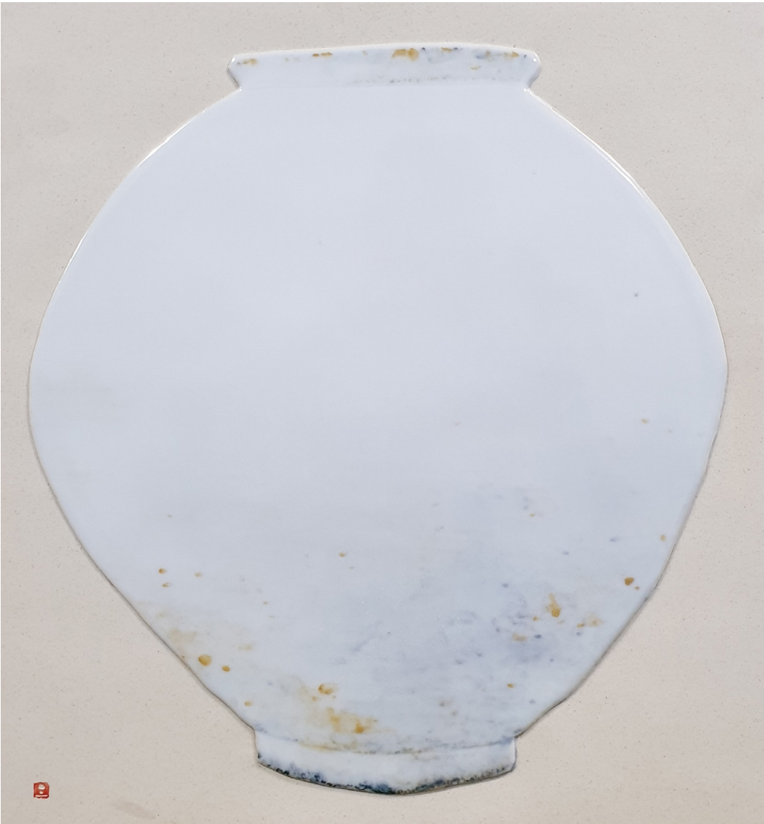
Rumination-Moon Jar, 57x57cm White Porcelain Plate, Lin Blend 1330 C, 2019