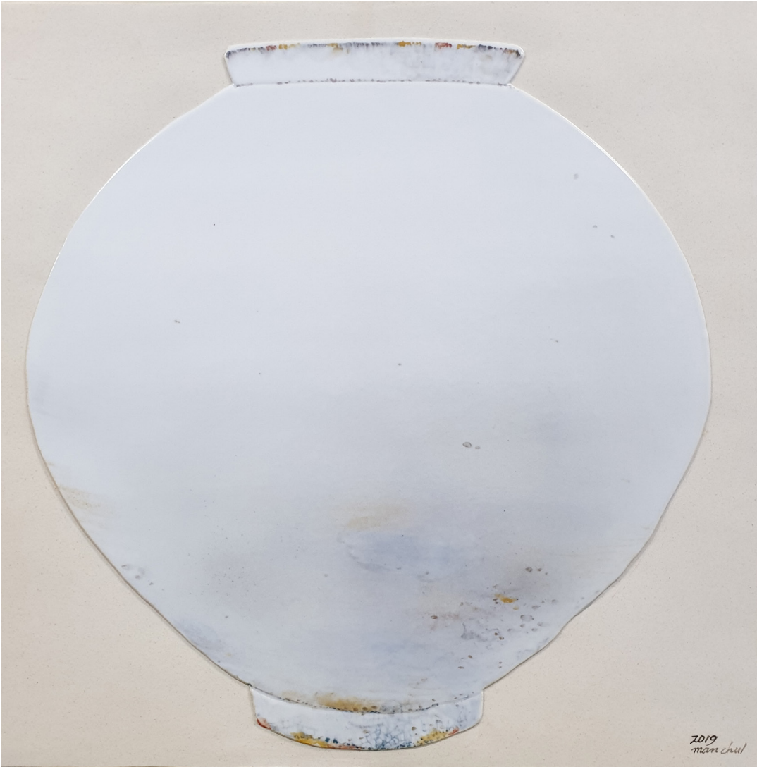
Rumination-Moon Jar, 57x57cm White Porcelain Plate, Lin Blend 1330 C, 2019