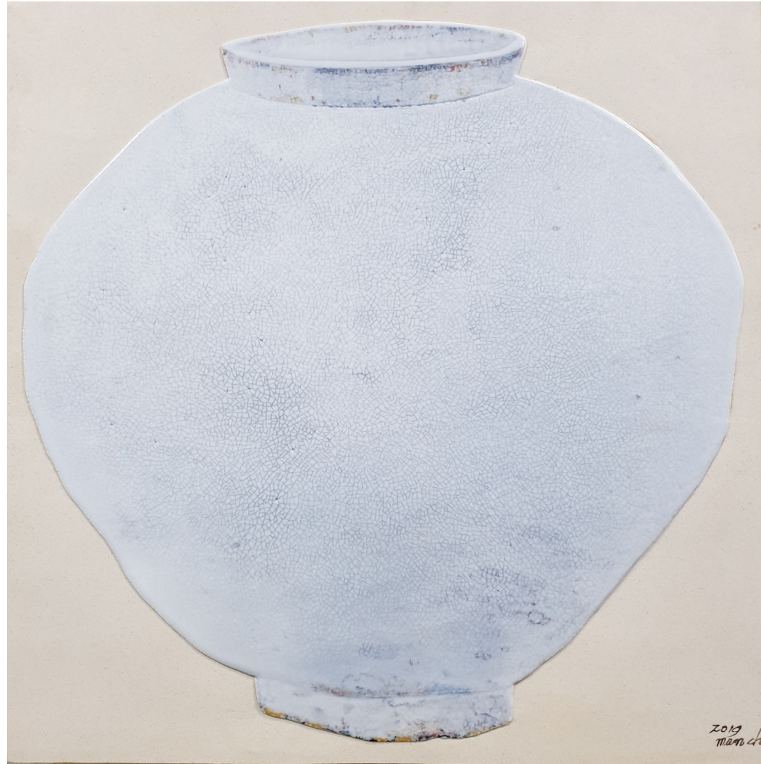
Rumination-Moon Jar, 57x57cm White Porcelain Plate, Lin Blend 1330 C, 2019