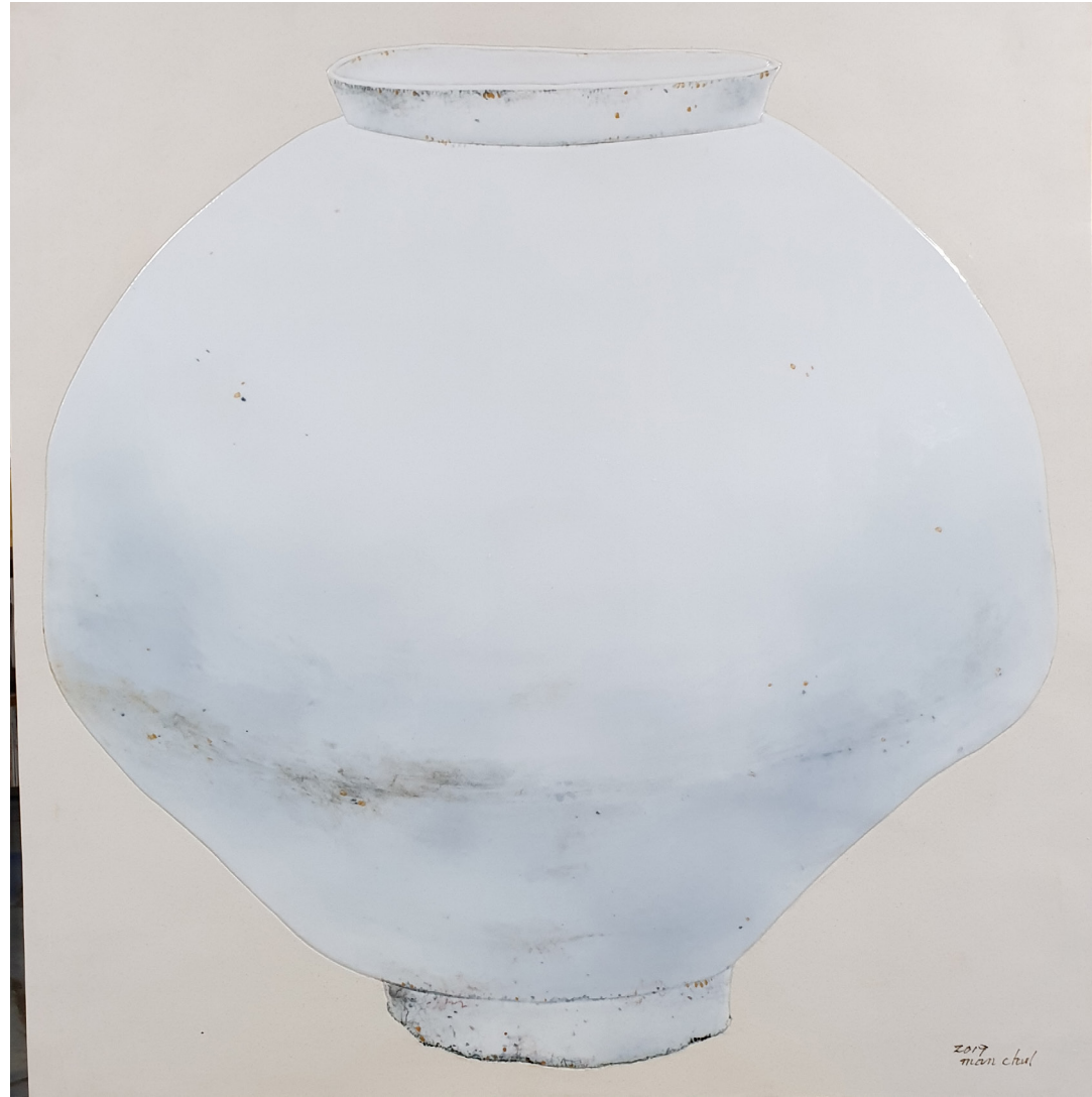
Rumination-Moon Jar, 57x57cm White Porcelain Plate, Lin Blend 1330 C, 2019