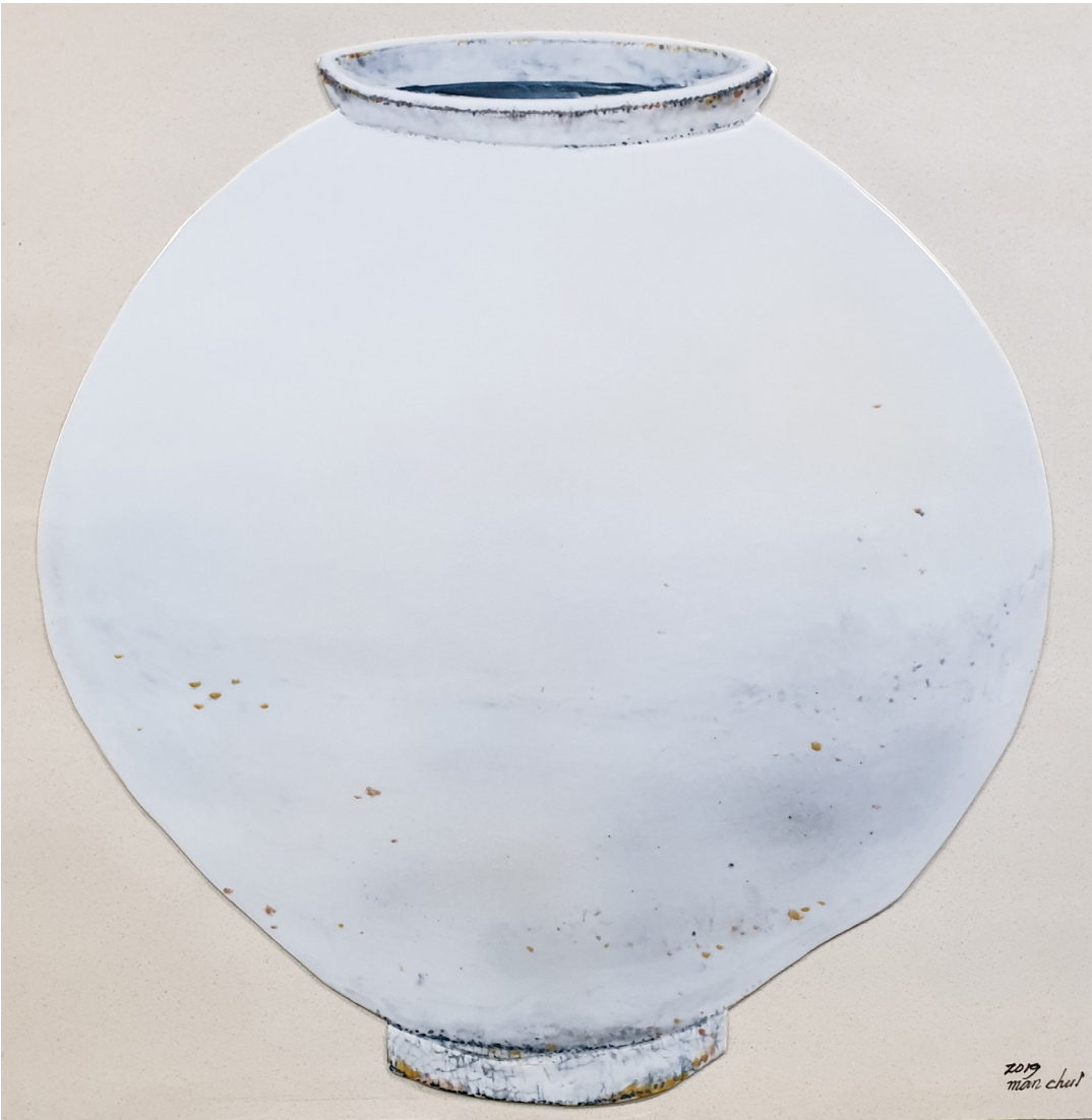
Rumination-Moon Jar, 57x57cm White Porcelain Plate, Lin Blend 1330 C, 2019