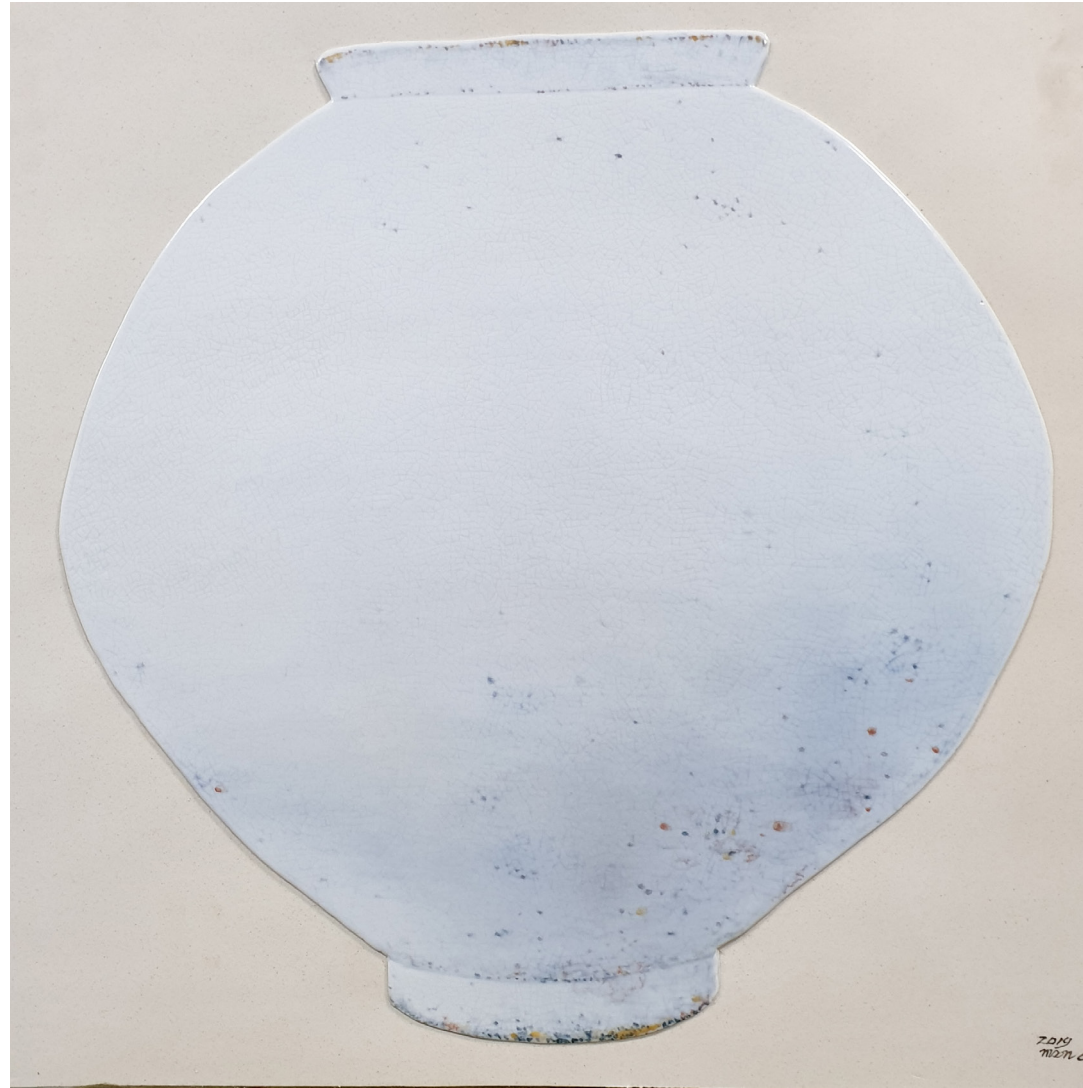
Rumination-Moon Jar, 57x57cm White Porcelain Plate, Lin Blend 1330 C, 2019