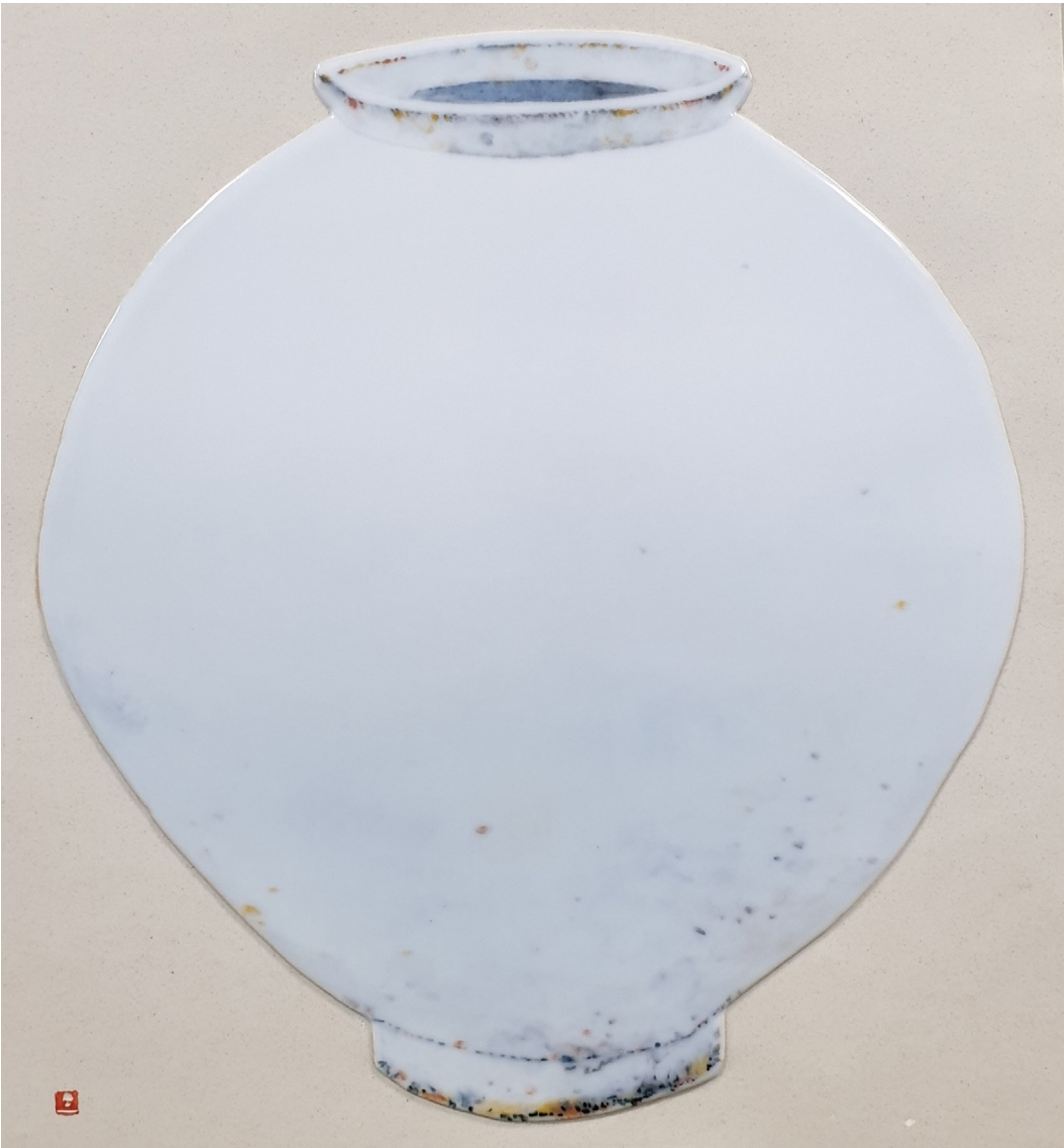
Rumination-Moon Jar, 57x57cm White Porcelain Plate, Lin Blend 1330 C, 2019