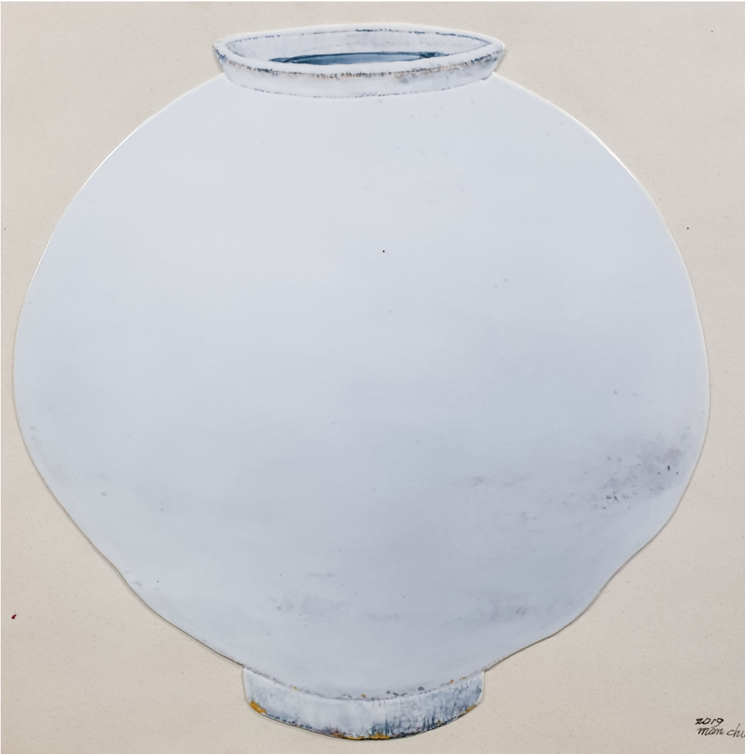
Rumination-Moon Jar, 57x57cm White Porcelain Plate, Lin Blend 1330 C, 2019