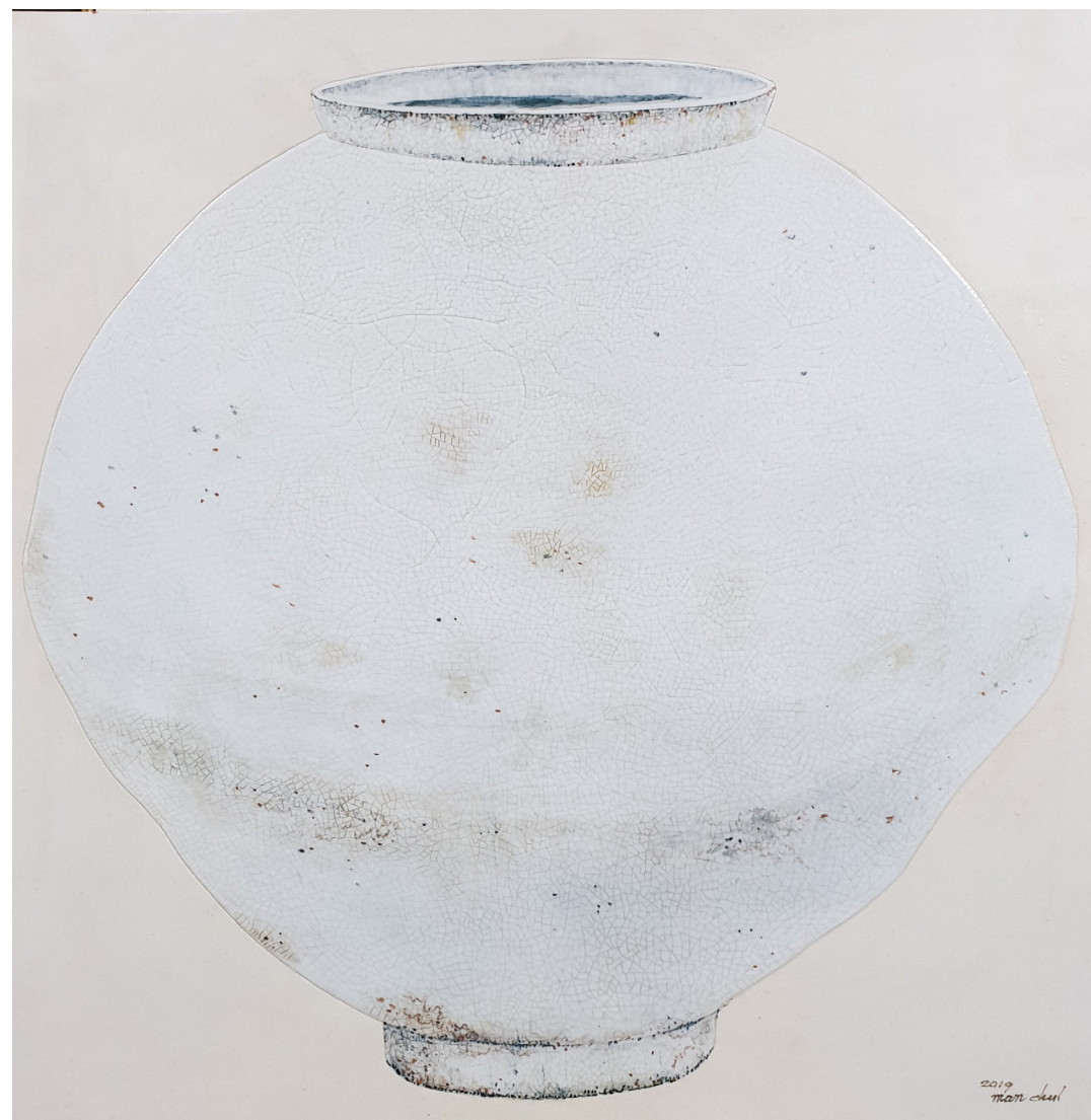
Rumination-Moon Jar, 57x57cm White Porcelain Plate, Lin Blend 1330 C, 2019