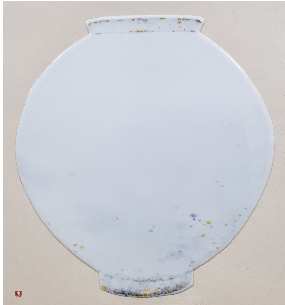
Rumination-Moon Jar, 57x57cm White Porcelain Plate, Lin Blend 1330 C, 2019