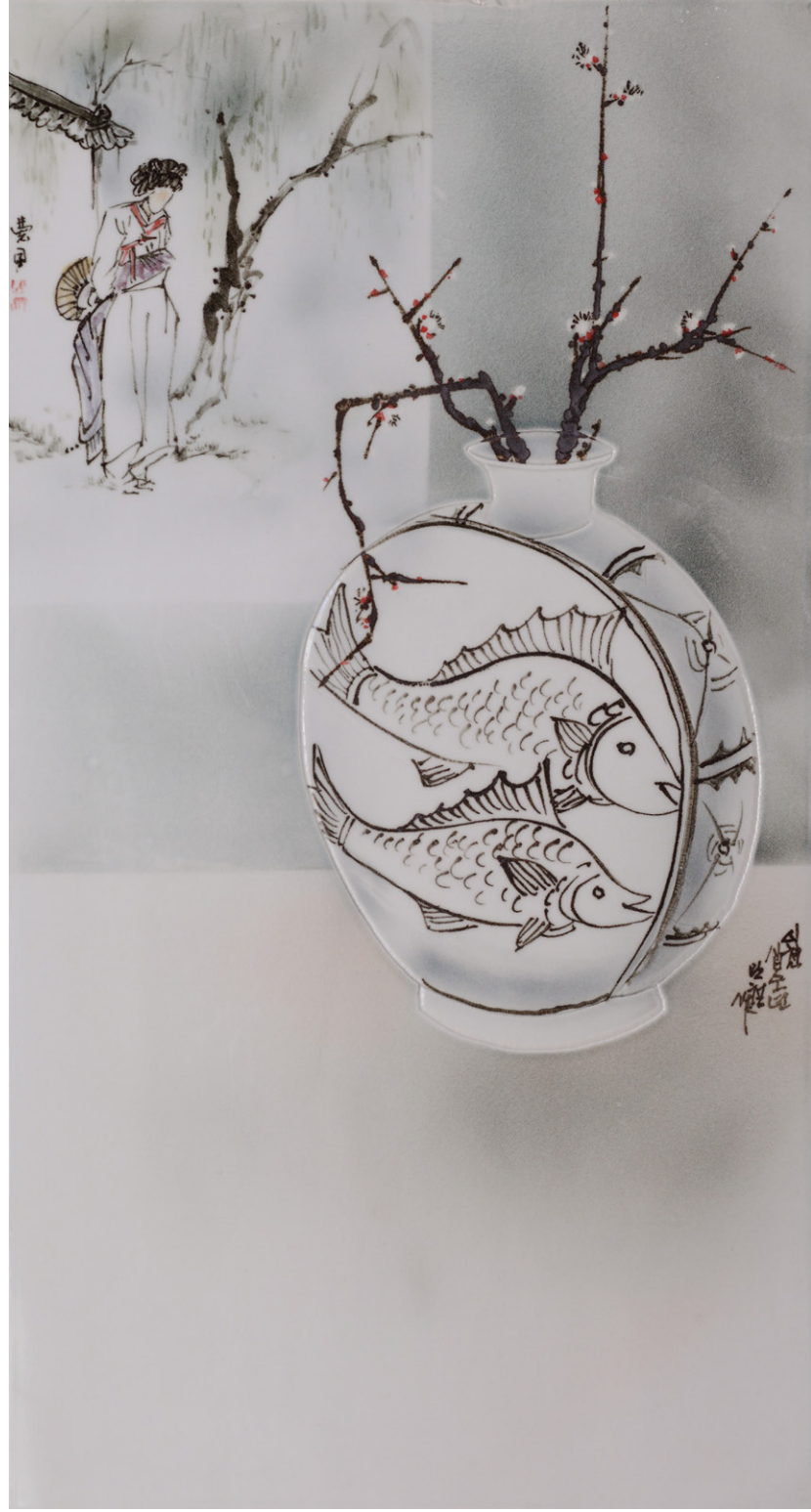
Rumination, Flat Bottle White Porcelain Plate, Lin Blend 1330 C, 44x81 cm, 2015