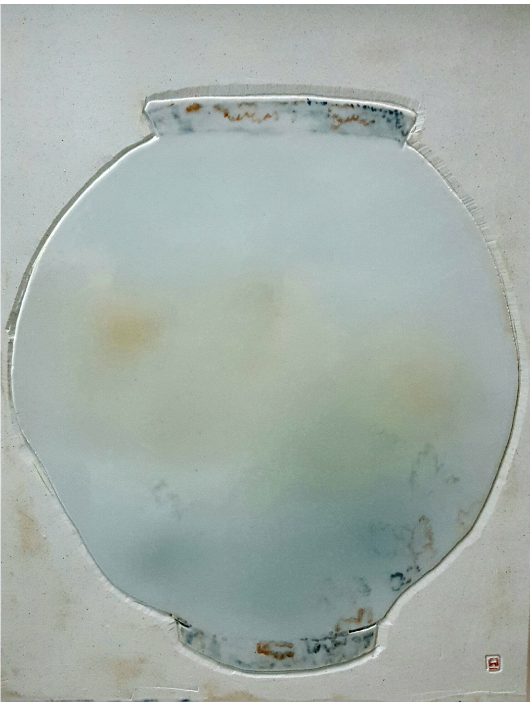
Rumination - Moon Jar 28.5x38.5cm