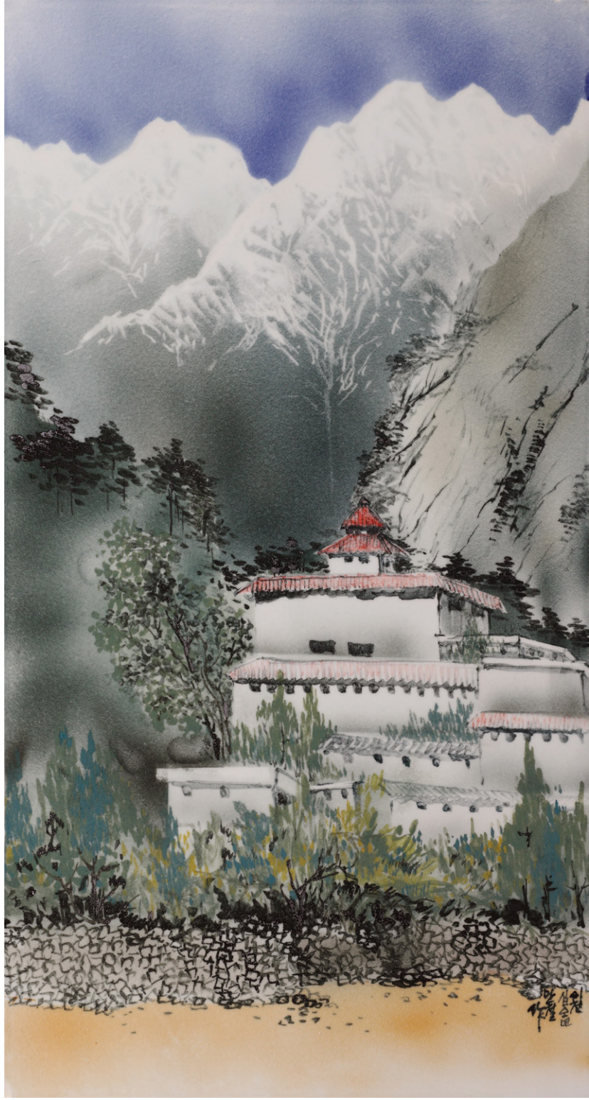
Landscape II White Porcelain Plate, Lin Blend 1330 C, 44x81 cm, 2015