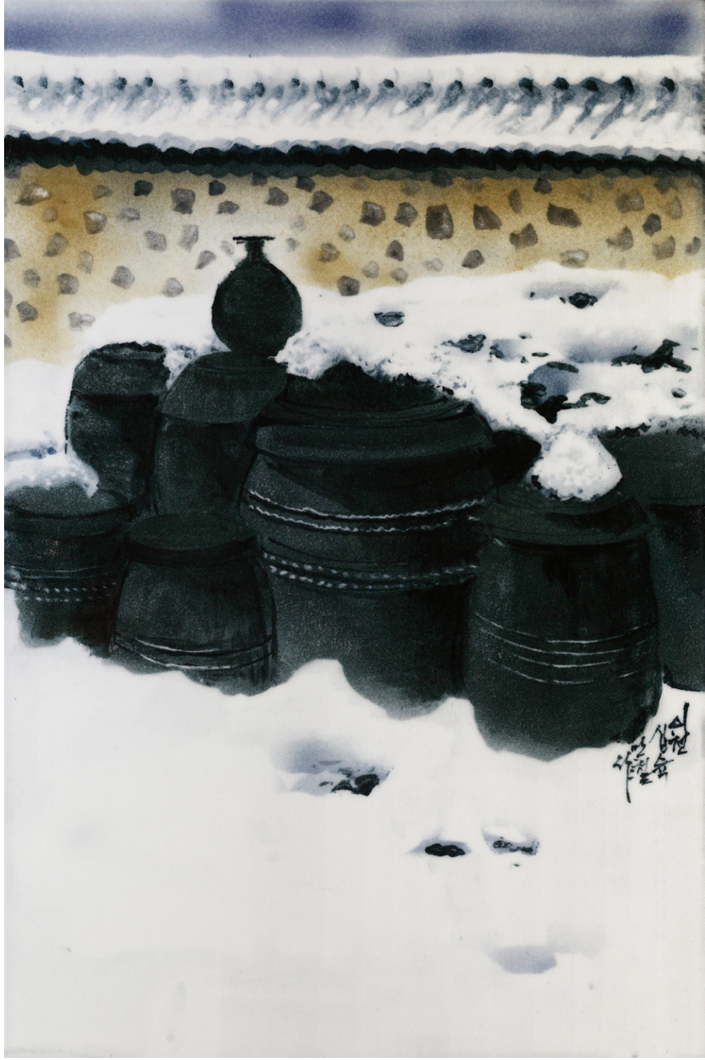
Crock Stand White Porcelain Plate, lin Blend 1330 C, 38x57cm, 2016