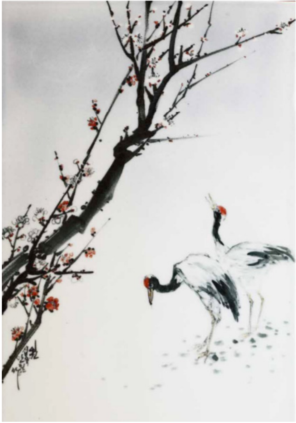
Starring I White Porcelain Plate, Lin Blend 1330 C, 38x57cm, 2016