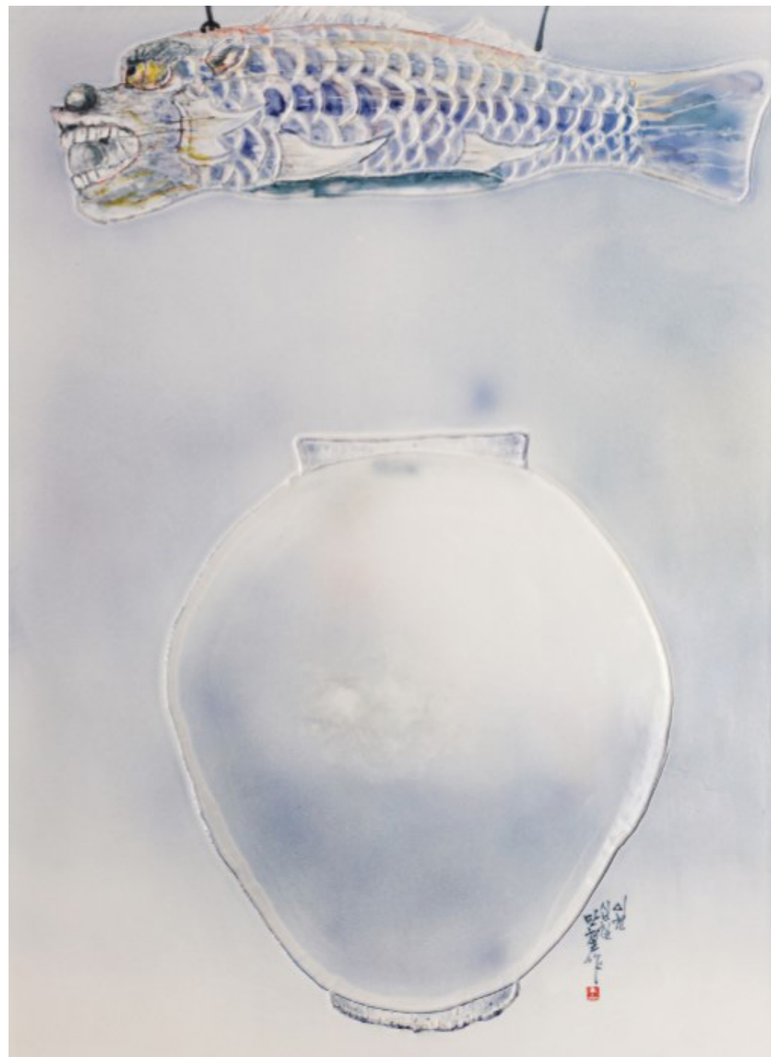
Rumination- Moon Jar(sandfish) 64 x 86cm, Porcelain Plate 1330C reduction firing, 2017