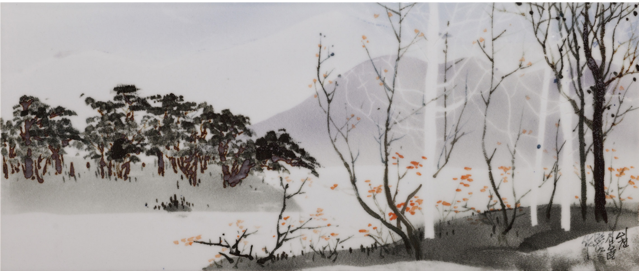
Riverside II White Porcelain Plate, Lin Blend 1330 C, 29x57cm, 2015