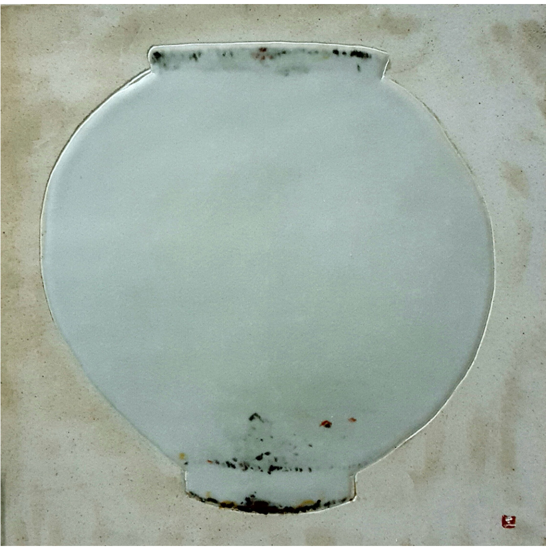
Rumination - Moon Jar 28.5x28.5cm