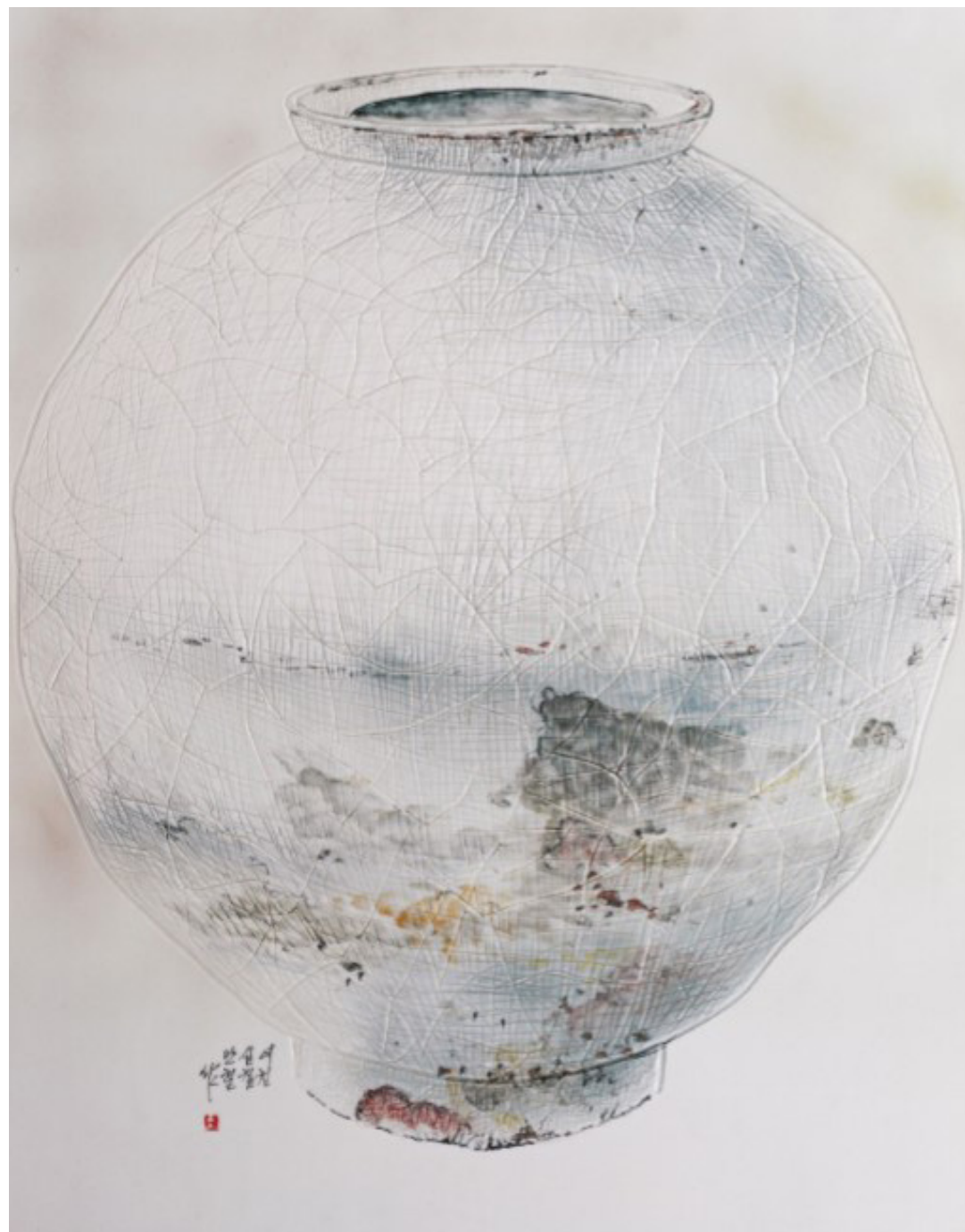
Rumination - Moon Jar 57 x 74cm, Porcelain Plate 1330C Reduction Firing, 2017