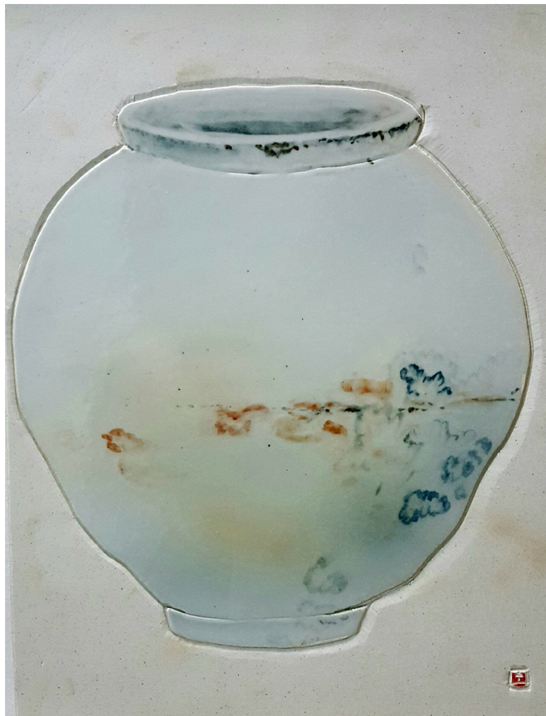
Rumination - Moon Jar 2 28.5x38.5cm