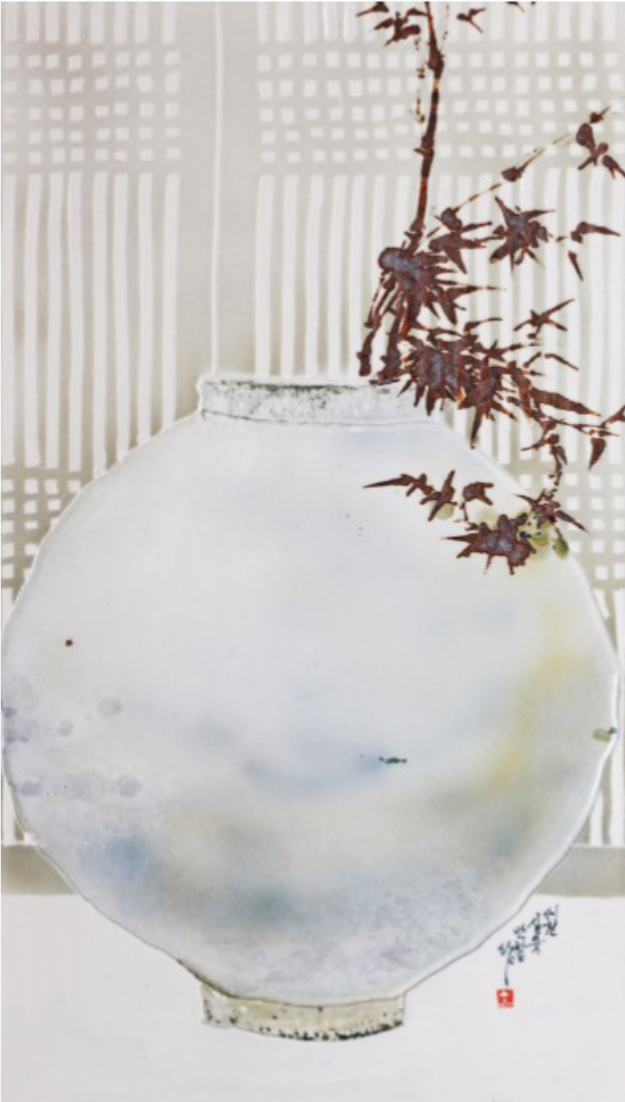
Rumination - Moon Jar (bamboo) 44 x 81 cm, Porcelain Plate 1330C reduction firing