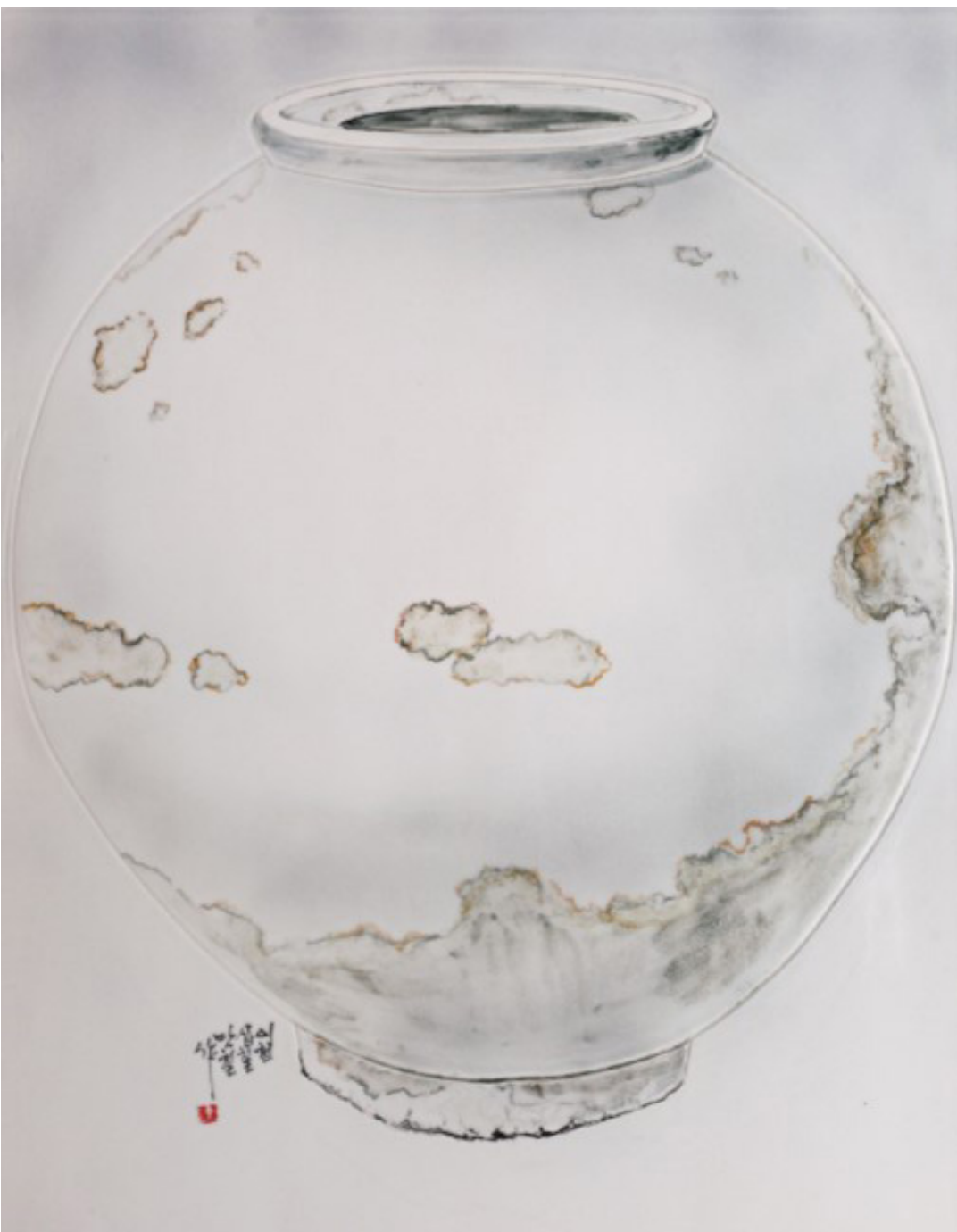
Rumination - Moon Jar 57 x 74cm, Porcelain Plate 1330C Reduction Firing, 2017