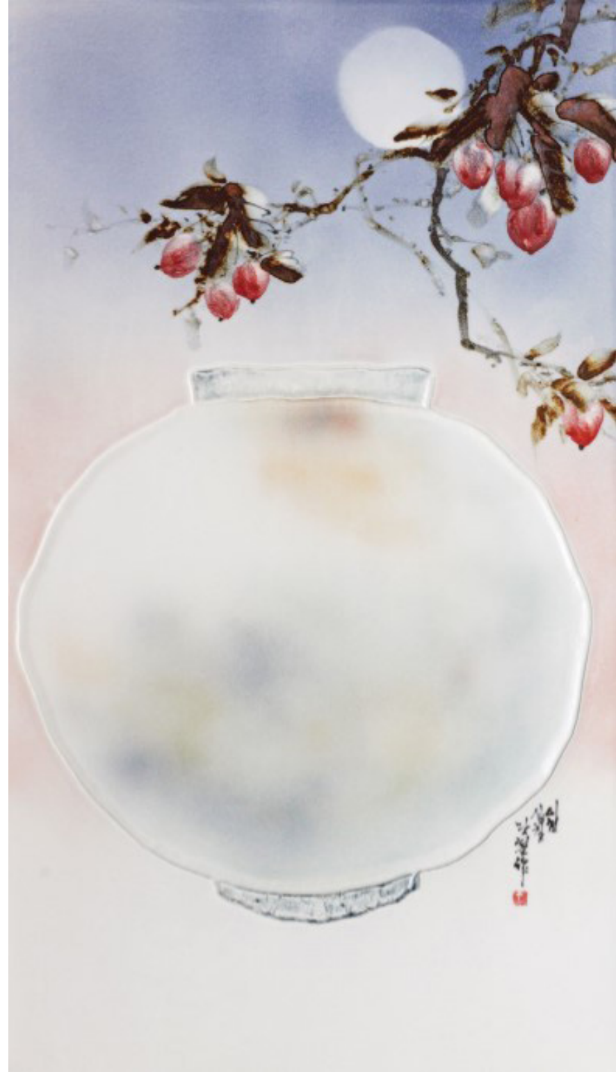
Rumination - Moon Jar (persimmon) 64 x 86 cm, Porcelain Plate 1330C reduction firing, 2017