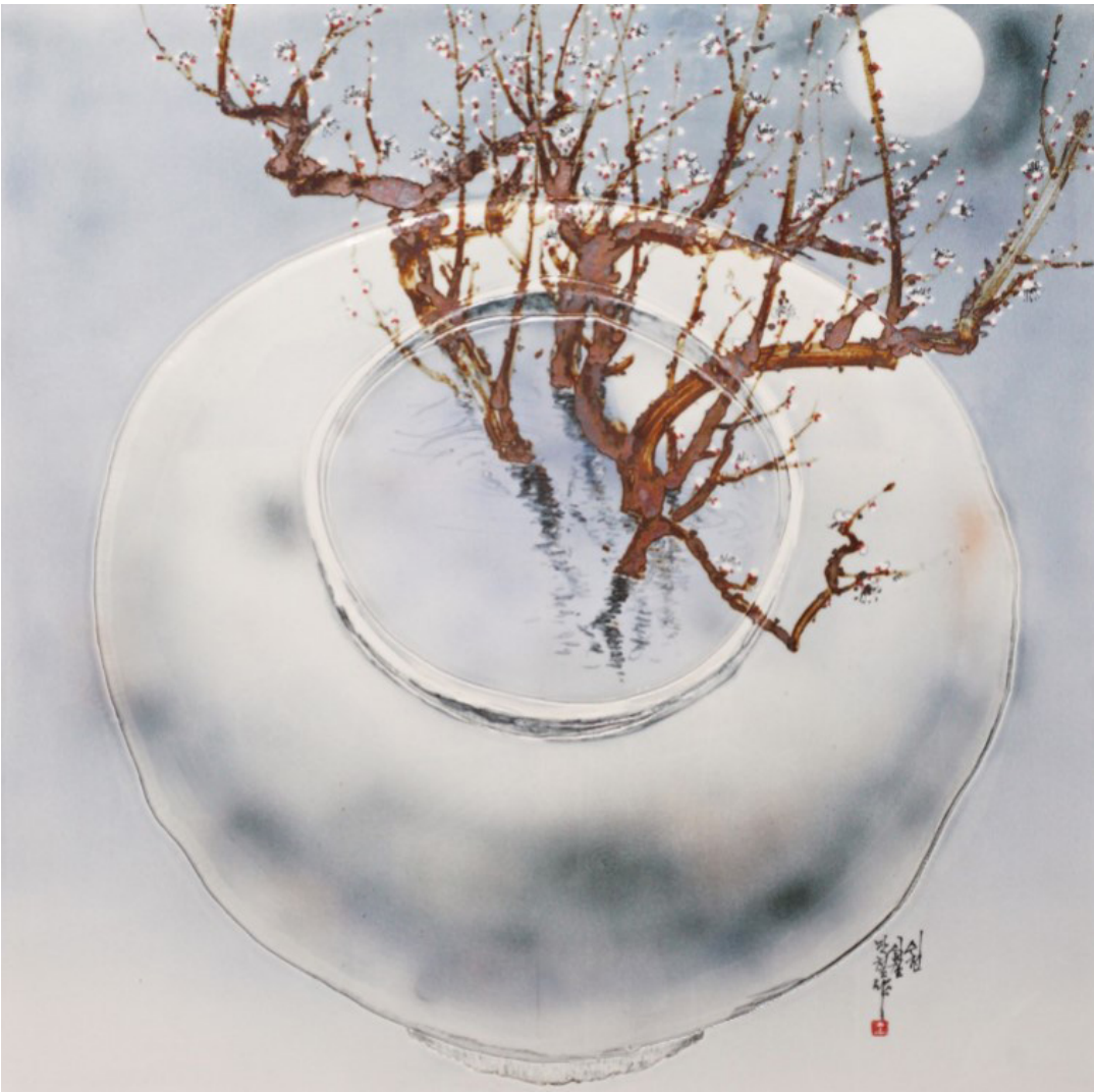
Rumination - Moon Jar 83 x 87cm, Porcelain Plate 1330C Reduction firing, 2017