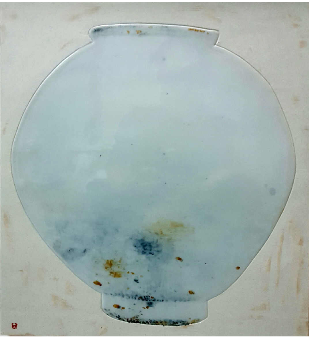
Rumination - Moon Jar 40.5x44.5cm