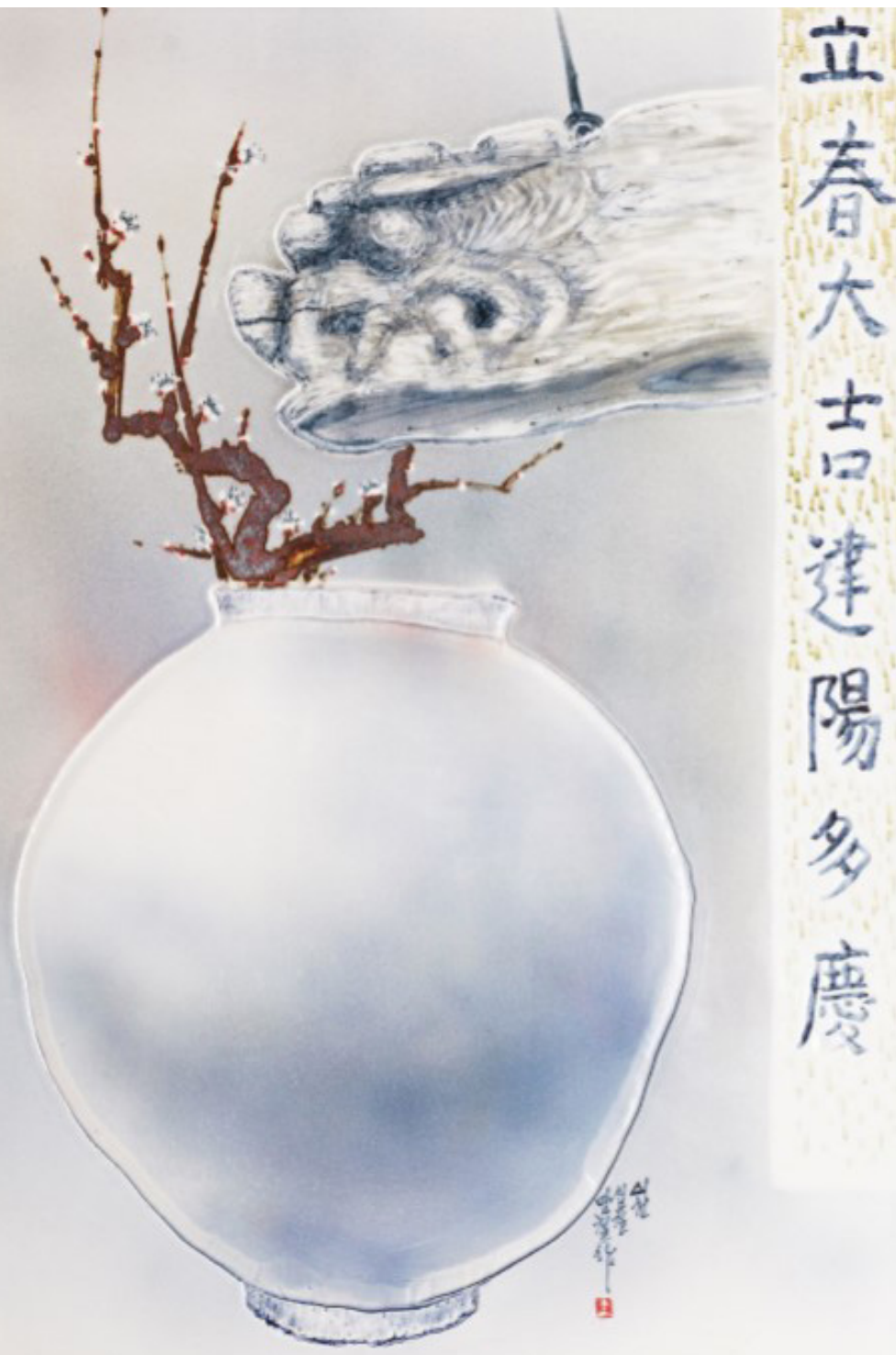
Rumination - Moon Jar(wooden fish) 64 x 86cm, Porcelain Plate 1330C, Reduction firing, 2017