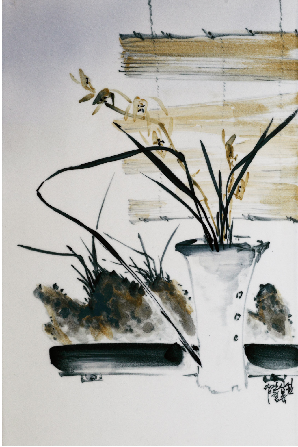
Orchid II White Porcelain Plate, lin Blend 1330 C, 38x57cm, 2016