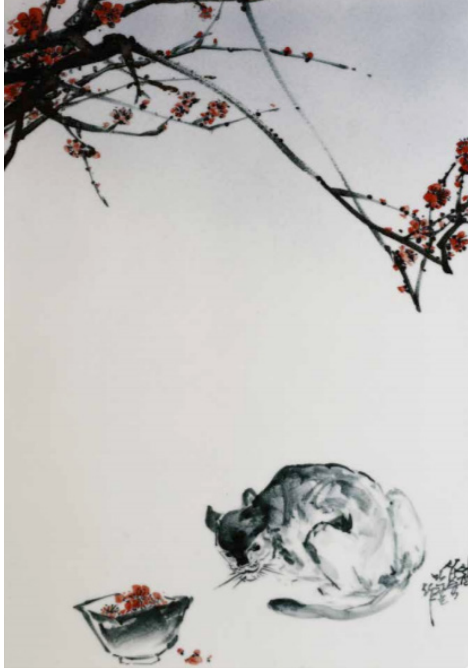
Starring II White Porcelain Plate, Lin Blend 1330 C, 38x57cm, 2016