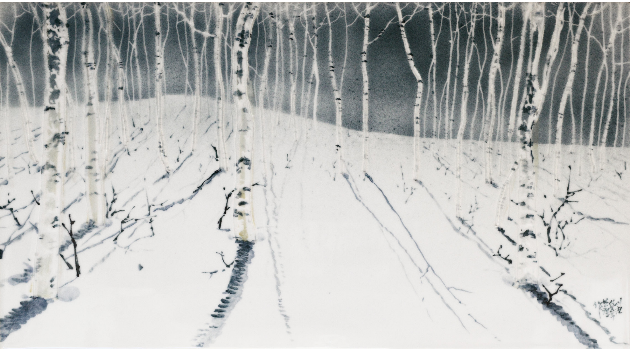
Birch White Porcelain Plate, Lin Blend 1330 C, 44x81 cm, 2016