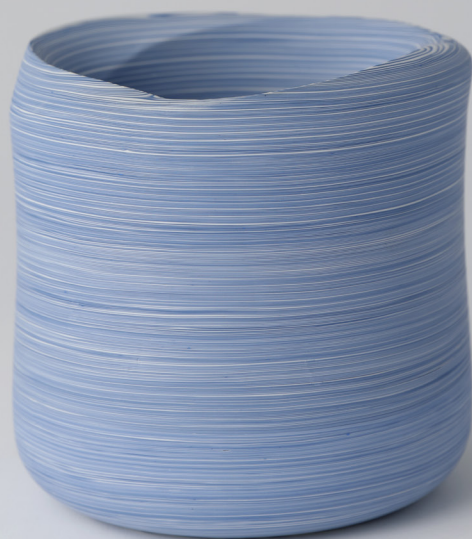
Small Vase with Blue Glaze Coating