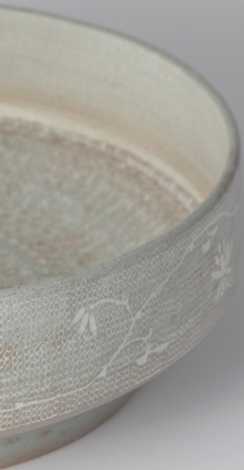
Buncheong Large Bowl